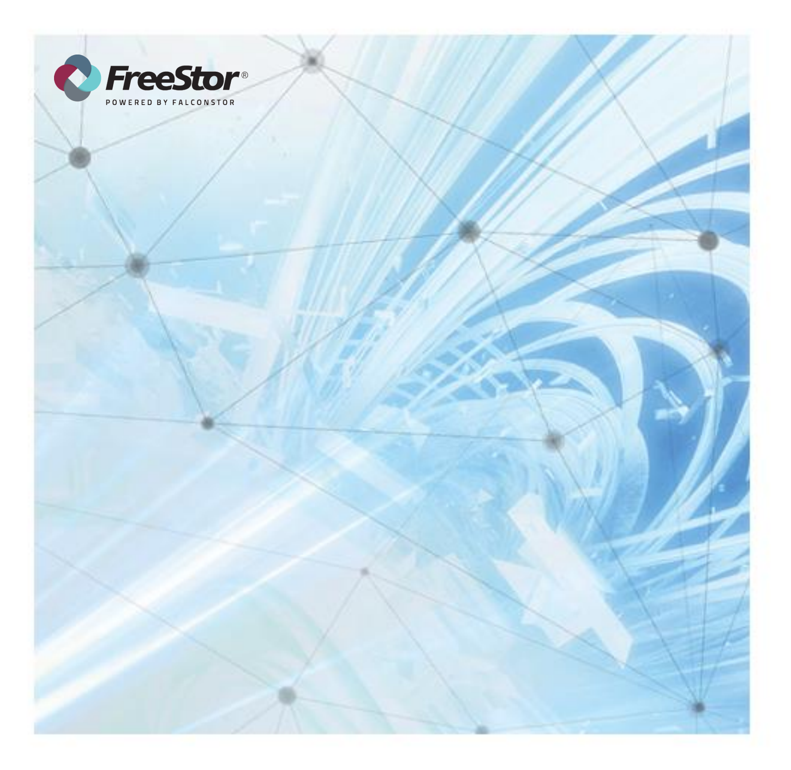
Business Continuity Disaster Recovery (BCDR) Planning for the Optimistic Pessimist